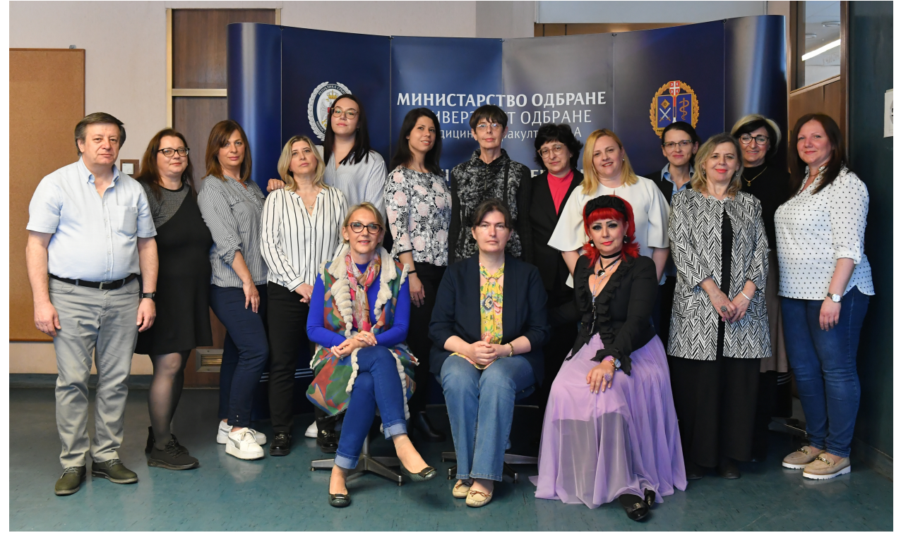
Fig. 13 – Center for Medical Scientific Information of the Faculty of Medicine of the Military Medical Academy (2024).

We entered the ninth decade of the journal's existence. The present Editorial Board and Editorial Office do not have an easy task. On one end, there is an enormous obligation toward the Vojnosanitetski pregled tradition, on the other is the vision of the future, and in between is the current state. Every effort to maintain the existing state (keeping the status quo ) is an imminent beginning of an end. The only way is stepping forward. Moving forward is possible only if we improve the quality of published articles and the quality of work of the Editorial Board and Editorial Office.