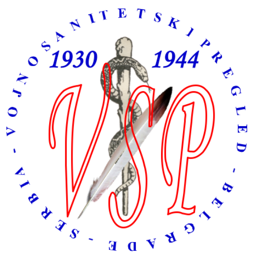
Fig. 8 – A new logo of the Vojnosanitetski pregled (2006).

In 2006, Professor Dr. Silva Dobrić (Figure 9) was appointed as Editor-in-Chief and remained in this position until 2020. During this time, several key moments related to the journal occurred. Professor Dobrić continued with the changes her predecessors started in order to improve the quality of the journal. The first fruits of the mentioned changes were harvested in 2008 when Vojnosanitetski pregled was accepted into the Science Citation Index Expanded (SCIe), a famous base of scientific journals of the