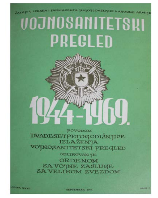
Fig. 3 – Cover page of the jubilee issue of the Vojnosanitetski pregled in 1969 dedicated to its 25th Anniversary.

From its foundation until today, the journal has been edited by 14 Editors-in-Chief (Table 1). All of them, each in their own way, often limited by circumstances in which they