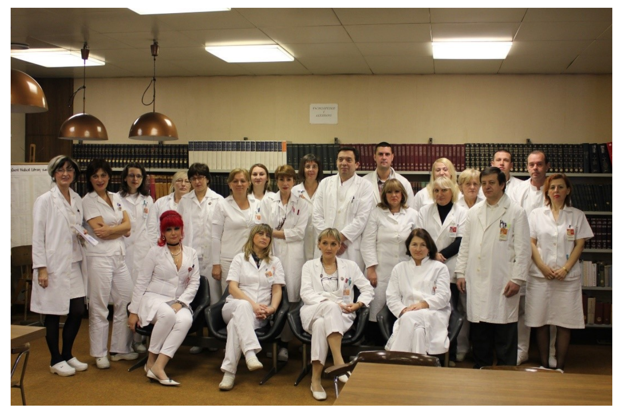
Fig. 12 – Institute for Scientific Information of the Military Medical Academy (2011).

The value of each journal is based on the value of its authors and reviewers. Therefore, many thanks go to the authors who have chosen Vojnosanitetski pregled to present their professional results during these years. Special thanks go to eminent reviewers who invested their time and knowledge to Vojnosanitetski pregled . It is a great pleasure and strong encouragement that, in the last two years, the number of Vojnosanitetski pregled reviewers was over 200 annually (<u>link</u>). We owe special gratitude to foreign reviewers who joined the Vojnosanitetski pregled review team and made it recognizable beyond our country's borders.