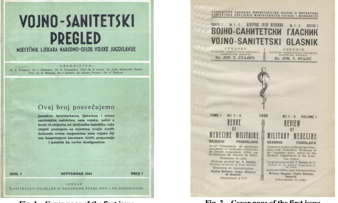
Fig. 1 – Cover page of the first issue of the Vojnosanitetski pregled (September 1944).

Reflecting the spirit of the time when it began to be released, Vojnosanitetski pregled was focused on the issues of the military medical service during the war and on current problems of war medicine. At the time, the main goal of Vojnosanitetski pregled was to increase the physicians' level of knowledge in the fields of war surgery, war epidemiology, and war military medical service. Hence, the published papers predominantly covered these topics. In these articles, initial information regarding sulfamidime, penicillin, dichlorodiphenyltrichloroethane-powder, etc. was provided.